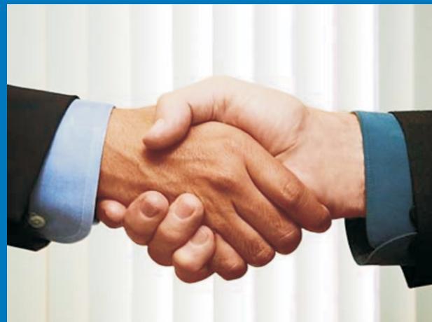
Nurturing relationships... For growth